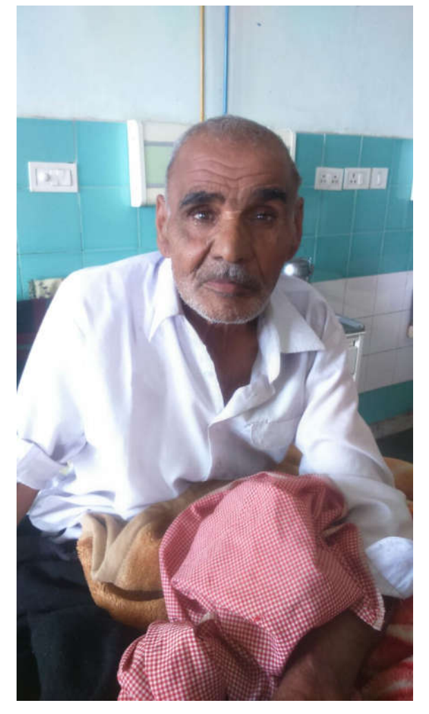
Fig 2 Ptosis of left eye in the patient of Horner's syndrome

MRI brain observed focal altered signal intensity area showing hyperintensity on T2 and FLAIR and hypointensity on T1W sequence with diffusion restriction observed in temporoparietal occipital lobe, left medulla oblongata and left cerebellar hemisphere suggestive of acute infarct. Elsewhere cerebral parenchyma appeared normal. Morphology of corpus callosum also appeared normal. No midline shift was observed and brainstem as well as cerebellum showed no pathological signs. However signs of diffuse atrophy were indicated by presence of prominent superficial sulci and ventricular systems (Fig 3).