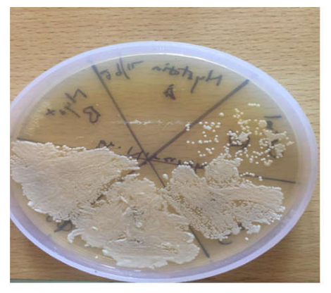
Fig 8 Candidal growth seen on SDA

Antifungal activity of nystatin is seen best among the 3 groups