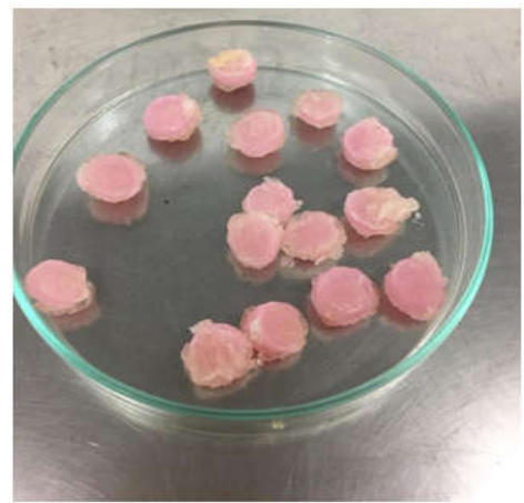
Fig 4 Acrylic disks coated with denture adhesive

Mixture of denture adhesive powder (Fixon) with normal saline without any other ingredient was coated onto the acrylic pellet in sterile condition. This was kept overnight to facilitate adhesion