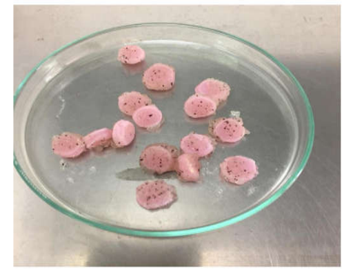
Fig 3 Grape seed incorporated denture adhesive

• The coated disks were kept overnight to facilitate adhesion of Grape seed extract to acrylic pellets.