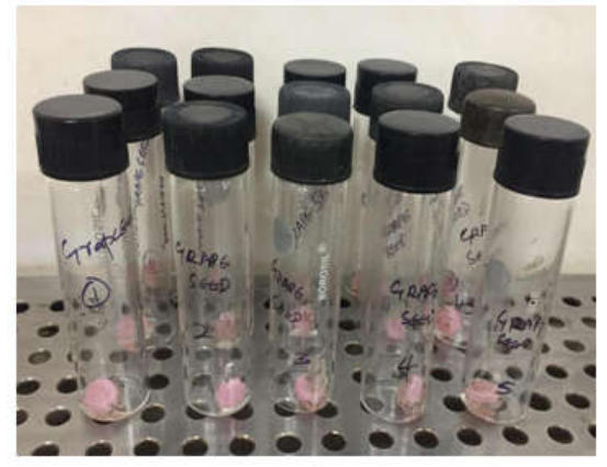
Fig 5 Incubation in McCartneys bottles

McCartney bottles and further incubated overnight at 37° C.