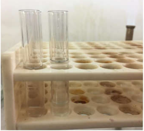
Fig 6 Candida suspension