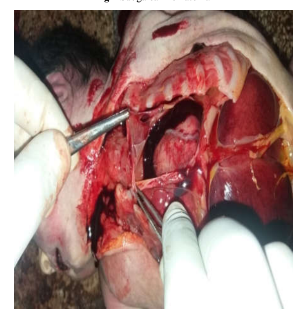
Fig 2 Cardiac tamponade