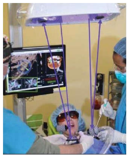
Fig 1 XNAV Dynamic guidance system

the problems that static drill guides present in endodontic application ^{6} .