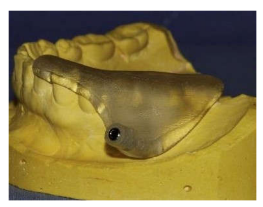
Fig 4 Incorporation of metal sleeve in virtual template