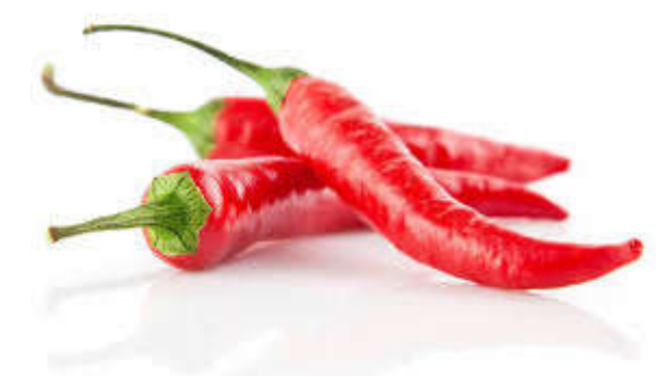
Fig No 1 Cayenne pepper