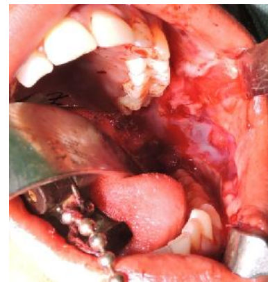
Fig.1B Post operative healing 2 weeks later