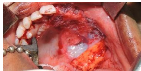
Fig 1A Palatal denuded bone covered with fibrin glue.

Our experience with Fibrin Glue in oral and maxillofacial surgical procedures was satisfactory. Fibrin Glue does not replace a good surgical technique but can be safely used in oral and maxillofacial surgery to get the best results.