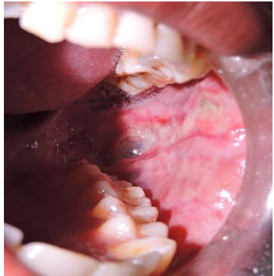
Fig 2B Healing of raw areas 2 weeks later