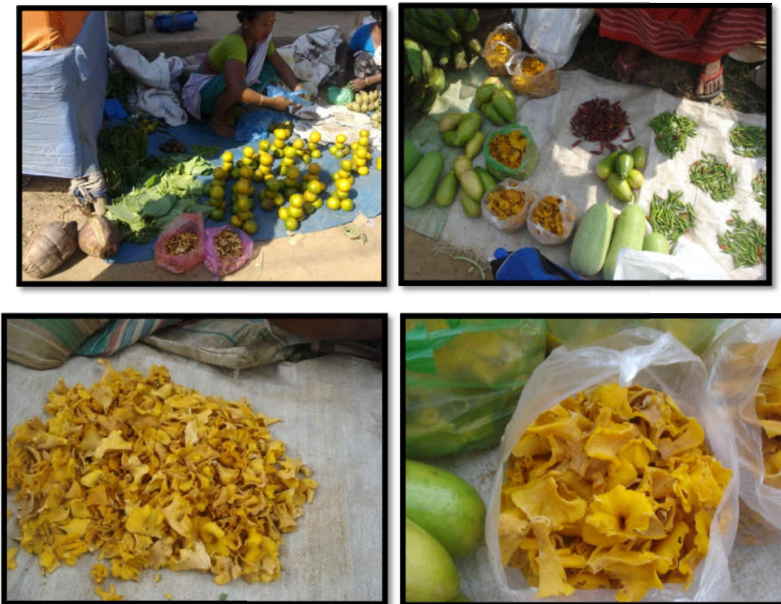
Figure 4 Wild edible fungi sold in markets of Kamrup district of Assam, India (A) and (B) Cantharellus cibarius (C) and (D) Cantharellus lateritius