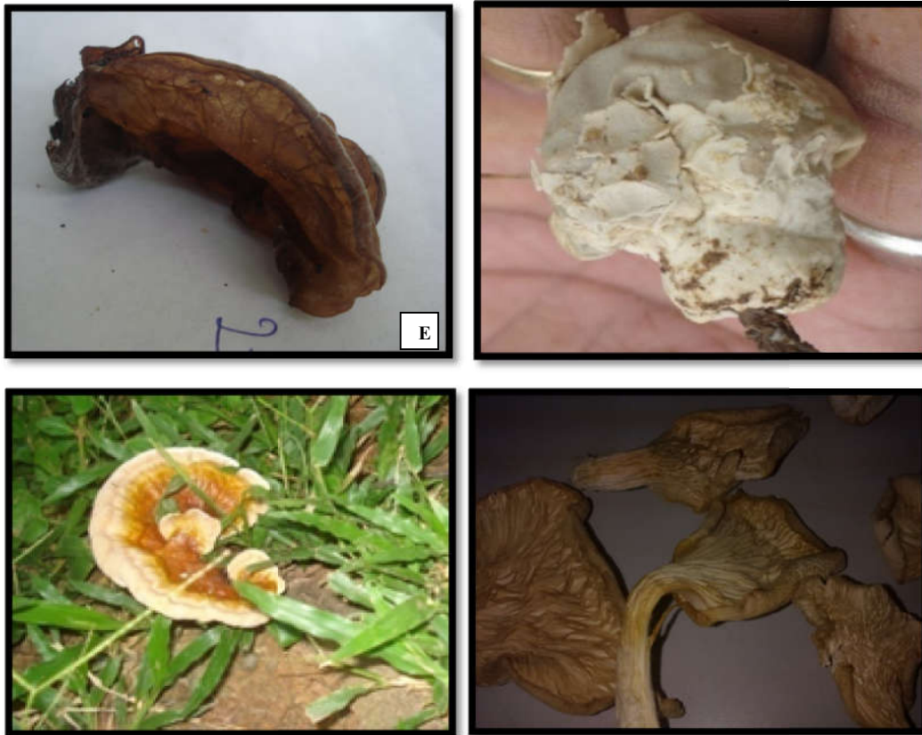
Figure 3 Macrofungi used as medicinal fungi; (A) Auricularia judae (B) Ganoderma lucidum (C) Bovista plumbea (D) Lentinula edodes