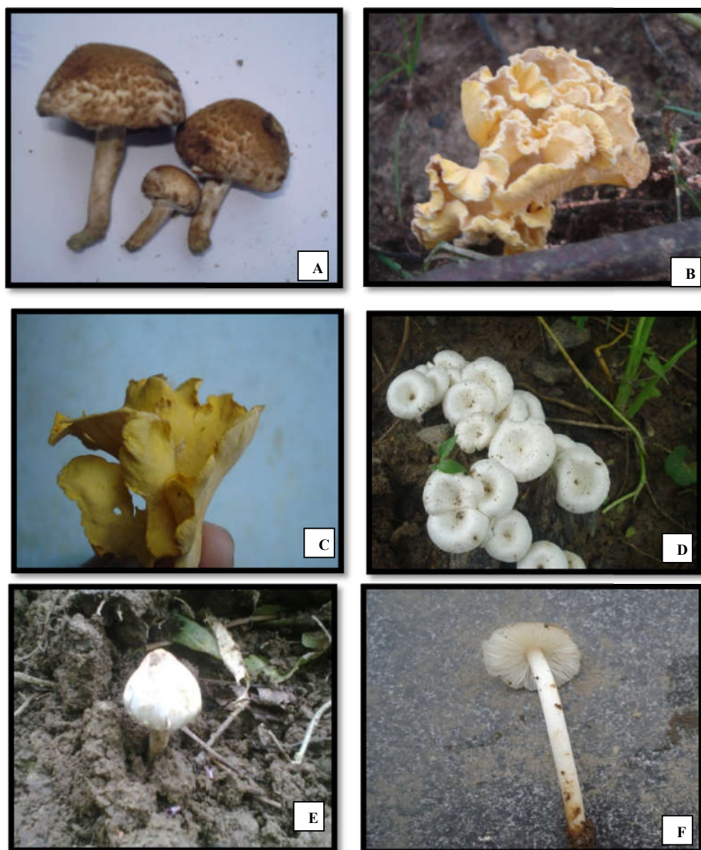
Figure 2 Macrofungi used as edible fungi (A) Agaricus bisporus , (B) Cantharellus cibarius , (C) Cantharellus lateritius , (D) Lentinus squarosulus , (E) Termitomyces heimii and (F) Termitomyces microcarpus .