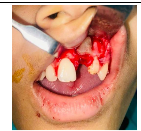
Figure 3- placement of platelet-rich fibrin for dead space management