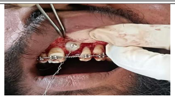
Figure 6 lingual button placed on the tooth