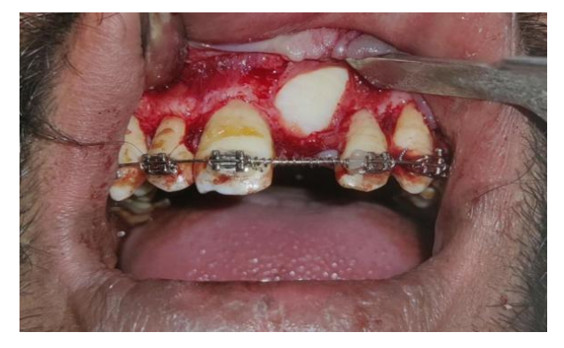
Figure 5 flap raised for exposure of the surgical region