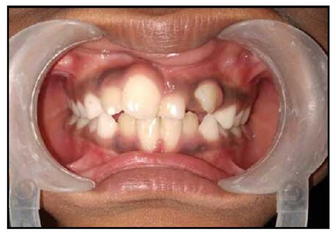
Figure 1 pre operative picture

A 10 years old female patient referred from department of pedodontics with a chief complaint of pain in the upper front tooth region that was present since past 1 month gave history of pain that was sudden in onset, aggravated on eating food and relived on having medication. on general examination ,vitals are stable, moderate built and nourished. on extra oral examination facial symmetry noted, mouth opening satisfactory. On intra oral examination vestibular tenderness noted was noted with respect to 21 with no obliteration. occlusion was maintained ,TMJ movement are normal (figure 1), CBCT was advised which revels a well defined lession measuring approximately 2-3cm in size. Impacted 21, Dentigerous cyst in relation to 21, Retained 61 (figure 2).