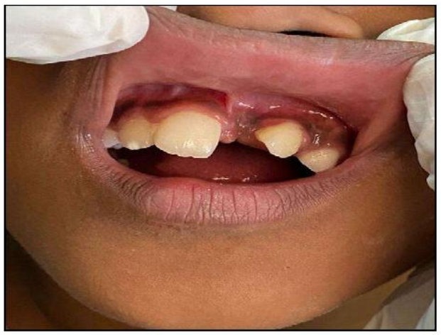
Figure 6 Post Operative One Month Follow Up