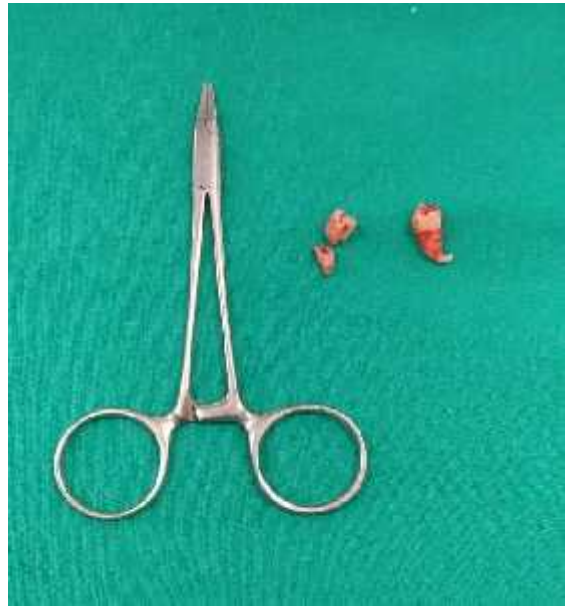
Figure 7 Surgically extracted supernumeraries of both side

The patient was informed about the presence of additional teeth on both sides of the mandible and was educated about the associated difficulties like those of maintaining the oral hygiene status. He was further explained the probable sequels of supernumerary teeth like swelling, cyst, and future malocclusions and was advised extraction of the bilateral supernumerary premolars. As the right sided supernumerary was deep seated in the mandible and closely in approximation with roots of 44, 45 and also with the ID canal, extraction of bilateral supernumeraries was done under General anesthesia. Supernumeraries extracted (Figure 7) resembled their permanent counterpart and was diagnosed as supplemental type of supernumerary teeth. Check-up done after 7 days, a month and further follow-ups were uneventful.