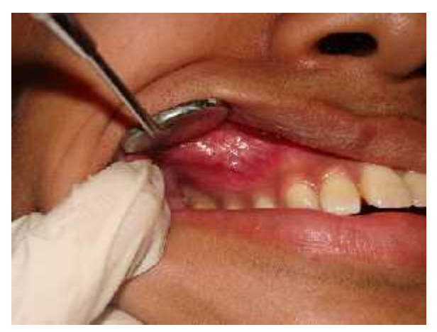
Figure 9 Intra oral photograph showing swelling on buccal aspect of 15 and