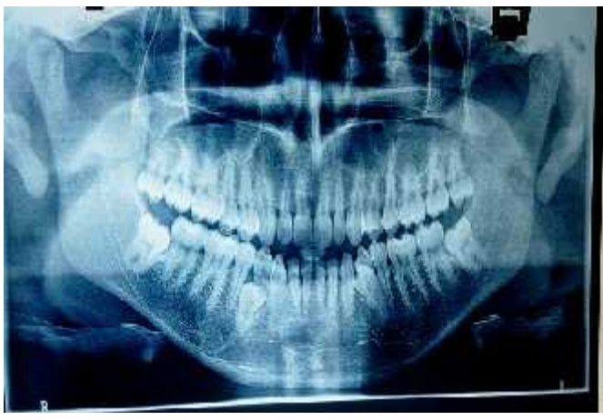
Figure 4 Panoramic radiograph showing bilateral supernumerary teeth in relation to mandibular premolars of both side

CBCT of the mandible (Figure 5 and 6) revealed presence of a supernumerary tooth in approximation to the radicular third of 34 and 35. Table 1 shows the dimensional detail of the relation of the respective tooth surface and adjacent anatomical landmarks.