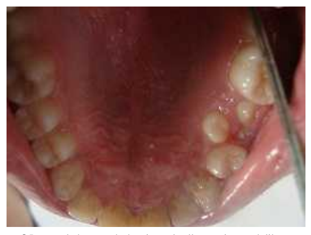
Figure 8 Intra oral photograph showing palatally erupting tooth like structure in relation to 25

A 12-year-old male patient reported to with the chief complaint of irregularities in upper left back teeth region. His familial, medical and dental histories were non-contributory. Intraoral examinations revealed an extra asymptomatic tooth like structure (Figure 8) present on palatal aspect of partially erupted 25. Clinical examination revealed a non-tender, bony swelling (Figure 9) present on buccal aspect of 15, 16. Patient had full set of permanent dentition. Oral hygiene status was satisfactory.