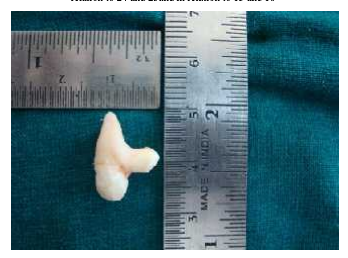
Figure 12 Surgically extracted supernumerary of left side showing concrescence