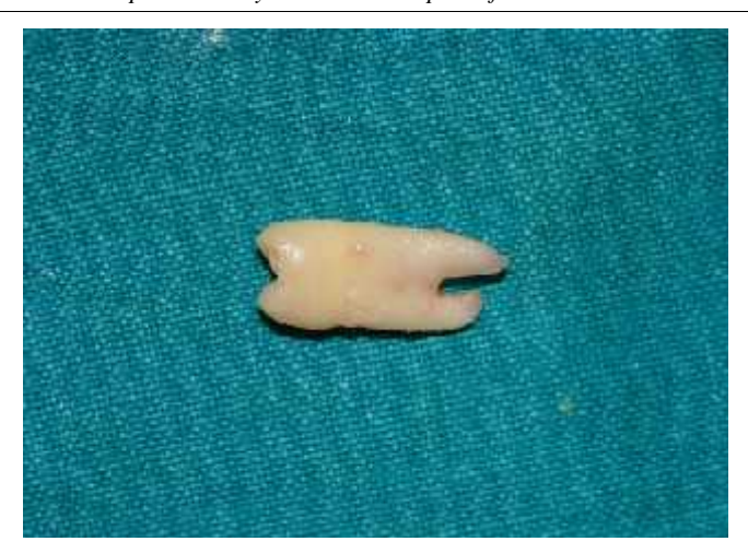
Figure 13 Surgically extracted supernumerary of right side