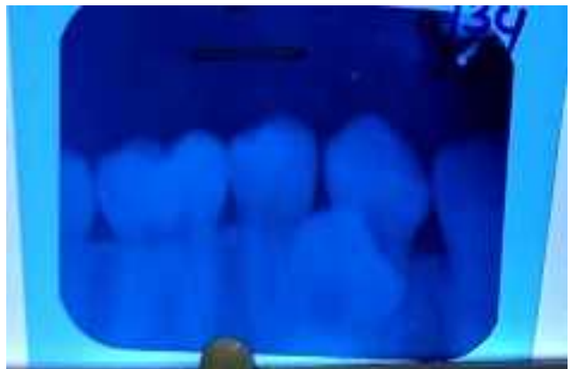
Figure 3 IOPAR showing supernumerary present in relation to 34 35 region

OPG (Figure 4) showed presence of supernumerary teeth bilaterally in respect to 33 34 and 35 on the left side and 44, 45 on the right side. Supernumerary in respect to 44 and 45 region was asymptomatic and no relevant clinical findings were obtained in that region. The exact buccolingual position of the right sided supernumerary could not be obtained from OPG and clinical examination, therefore Cone Beam Computed Tomography (CBCT) of mandible was advised.