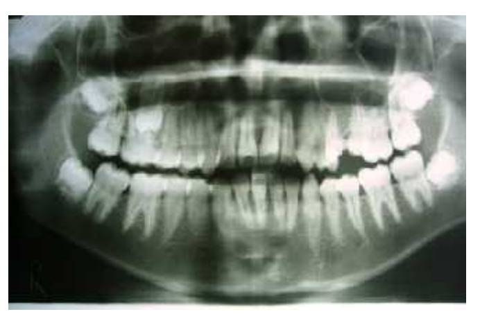
Figure 11 Panoramic radiograph showing bilateral supernumerary teeth in relation to 24 and 25and in relation to 15 and 16