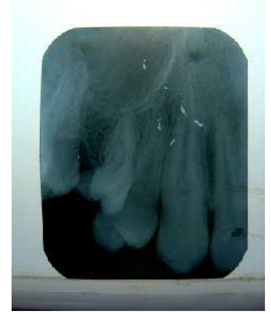
Figure 10 IOPAR showing supernumerary present in relation to 24 25 region. The patient was informed about the presence of supernumerary teeth, its associated difficulties and possible sequels and was further advised extraction of the same on both sides. Surgical extraction on the right side was performed under local anaesthesia. The supernumerary teeth observed were of conical shape with concrescence at root portion on left side (Figure 12) and supplemental to 14 on the right side (Figure 13) with completely formed roots. Check-ups were done after 7 days and a month were uneventful.

IOPAR of 25 region (Figure 10) along with OPG (Figure 11) were advised which revealed presence of supernumerary between 24, 25 and between 15,16. Based on the clinical findings, buccal positioning of right supernumerary was ascertained.