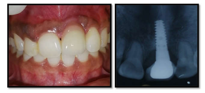
5 months post op