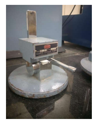
Fig 5 Crease Resistance

the upper surface of fabric goes on extension and lower surface goes on compression.