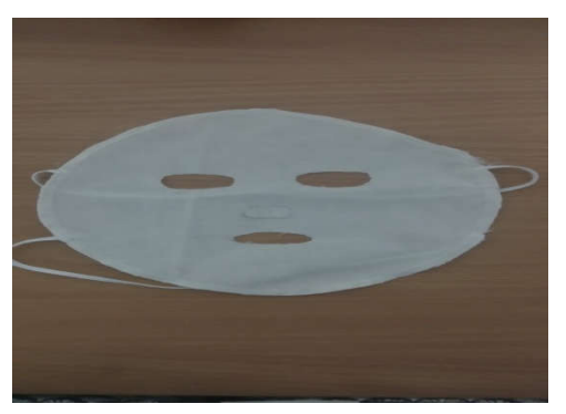
Fig 7 knitted fabric face mask

The fabric is cut according to the standard face measurement and overlocked at the edges.