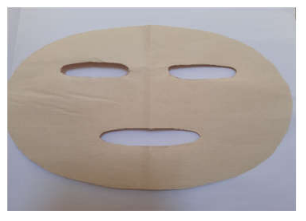
Fig 6 face mask pattern

The fabric is cut according to the standard face measurement and overlocked at the edges.