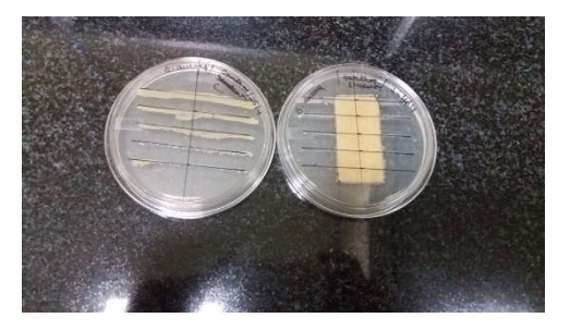
Fig 2 Antibacterial test using Staphylococcus aureus