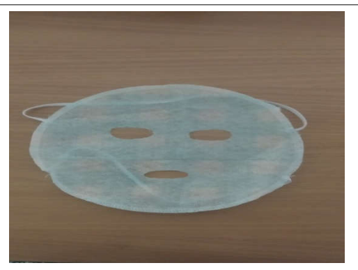
Fig 8 non-woven fabric face mask