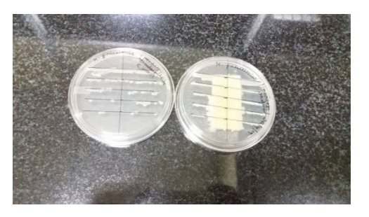
Fig 1 Antibacterial test using Klebsiella pneumonia

It was incubated at 37 °C± 2 °C for 18 – 24 h. and examined the incubated plates for interruption of growth along the streaks of inoculum beneath the test sample and for a clear zone of inhibition beyond its edge. The average width of a zone of inhibition is calculated along a streak on either side of the test specimen using formula W = (T-D)/2, where W = Width of the clear zone of inhibition in mm, T = Total diameter of the test specimen and clear zone in mm, D = Diameter of the test specimen in mm.