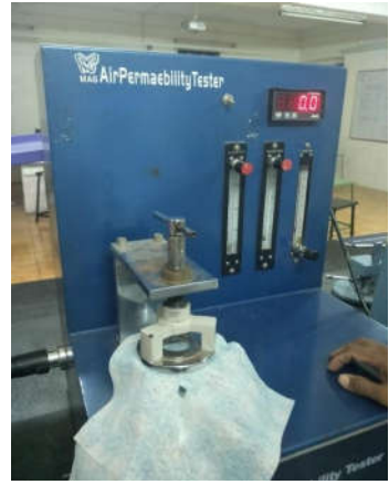
Fig 6 air permeability

When the fabrics is tested for air permeability, The air permeability values is higher for non-woven fabric compared to woven and knitted fabric. So that the non-woven fabric due to its structure might give higher air passage.