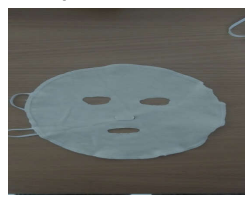
Fig 9 woven fabric face mask