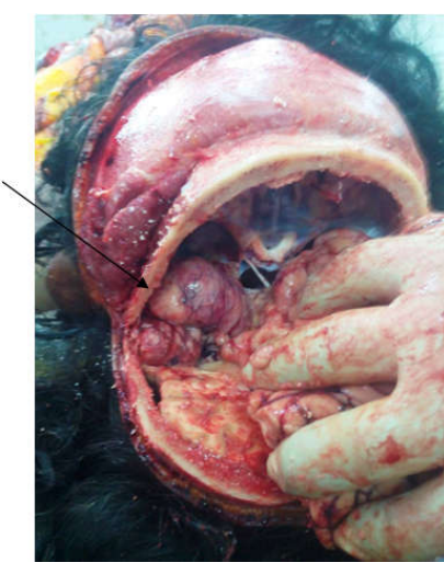
Fig 2 The photograph showing a mass (space occupying lesion) present over left temporal region of brain extending to the left side of base of skull over middle cranial fossa in sphenoid wing.