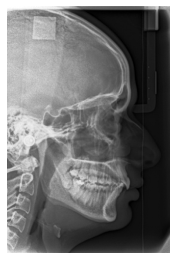
Figure 1 Lateral Cephalograph

best suits the patient in terms of the size and arrangement must be evaluated as these features represent the characteristics of the family or the ethnicity. It has been recognized over the years that various ethnic groups represent significant variations in the craniofacial morphology and soft tissues. <sup>3,4</sup> This justifies the need to study and development of norms for population with unique facial morphology. Hence, the purpose of this study was aimed at the creating norms of the beta angle for kumaon subjects by comparison with the Caucasian population.