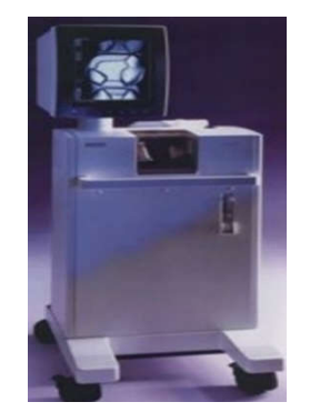
Fig 6b CEREC 2