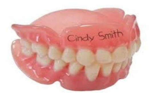
Fig 2 A Fig 2b

The American Dental Association 5.6 has described certain criteria for denture marking: The identification should be specific. The identification should be simple. The mark should be fire and solvent resistant. The denture should not be weakened. The mark should be cosmetically acceptable.