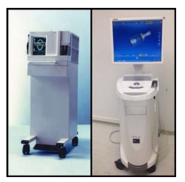
Fig 6a CEREC 1

technician then verifies the fit of the milled coping or framework. ^{\rm 14}