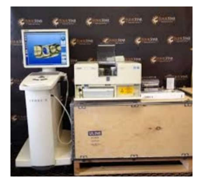
Fig 6c CEREC 3

E4D Dentist System: Presently it is the only system besides CEREC that permits same day in-office restorations. This system includes a laser scanner (Intraoral digitizer), a design center and a milling unit. The scanner is placed near the target tooth, and has 2 rubber feet that hold it to specific distance from the area being scanned. The software gradually creates a 3D image as each picture is taken. The design system automatically detects the finish lines and marks them on the screen. As soon as the restoration is accepted, the data are transmitted to either the in-house milling machine or a dental laboratory. The office milling machine will then manufacture the restoration from the chosen blocks of ceramic or composite.<sup>18</sup>