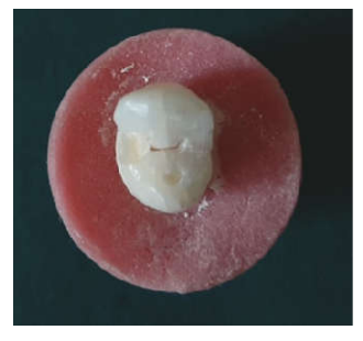
Figure 2 Cavity preparation

Class II mesial box shaped cavities was prepared using a highspeed hand piece under air-water spray. Bucco-lingual width of the cavity was 1/3 rd of buccolingual width of the tooth with 2 mm axial depth. (Fig 2)All the preparations were done with 245 tungsten carbide bur in a high speed hand piece with copious air water spray.