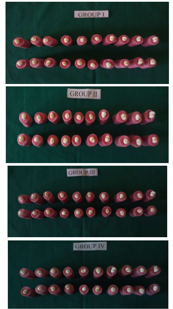
Figure 1 Tooth samples mounted in acrylic block

Eighty freshly extracted intact, non-carious, calculus free human maxillary premolars molars were collected and mounted in self-cure acrylic resin blocks, with the crown uppermost and long axis vertical. The level of the resin was limited to 1.0 mm below the cemento - enamel junction. (Fig 1)