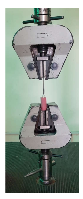
Figure 3 Load applied on the teeth in Universal Testing Machine

Fracture resistance was tested with a steel ball of 3mm diameter with a cross head speed of 1mm/min in Universal Testing Machine-Instron. Each tooth was subjected to vertical load on the occlusal surfaces till the restorations were fractured. The control group (intact teeth without any restoration) was also subjected to vertical load till the teeth fractured (Figure 3). The load was noted and recorded. The load at which the restorations fractured were noted and recorded and was statistically analysed.