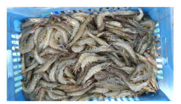
Fig 2.3 Harvested shrimps with LSS