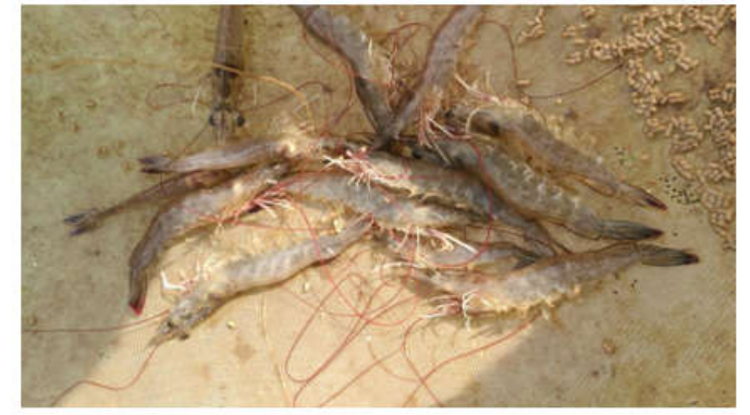
Fig 2.4 Affected shrimps in check tray