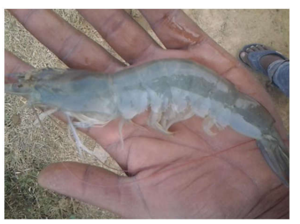
Fig 2.1 Observation of LSS

Loose Shell Syndrome (LSS) in Litopenaeus vannamei culture ponds at Nellore district shrimp farming areas (Fig 2.1 to 2.4)