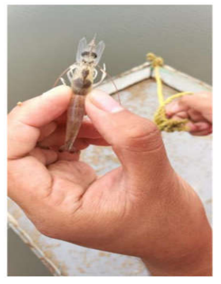
Fig 2.2 Observation in check tray